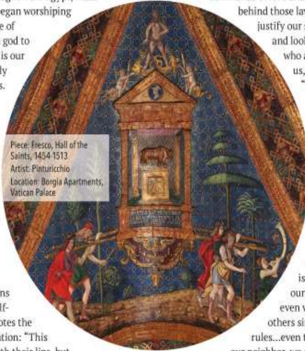
Piece: Fresco, Hall of the Saints, 1454-1513 Artist: Pinturicchio Location: Borgia Apartments, Vatican Palace

Jesus accused the Pharisees of falling into a similar trap. They slavishly revered human traditions that didn't reflect the heart of God. They hid behind laws created in the name of religion to serve themselves and their desire for power. Jesus overturns the tables of their self-justifications. He quotes the prophet as an accusation: "This people honors me with their lips, but their hearts are far from me" (Mark 7:6).